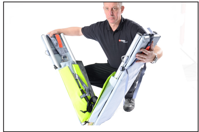
Figure 4 - Preparing the Paraguard® for use