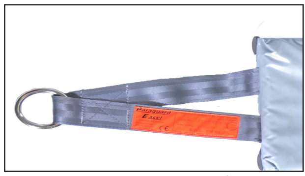
Figure 1 - Serial Number Identification

The products sold by Ferno (UK) Ltd. are covered by a limited warranty. The complete terms and conditions of the limited warranty, and the limitations of liability and disclaimers, are also available upon request by calling Ferno (UK) Ltd. on +44 (0) 1274 851999.