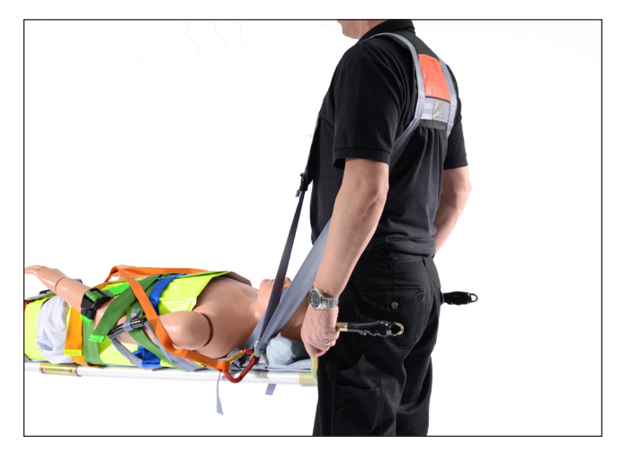
Figure 22 - Using Shoulder Harness

NOTE: The shoulder harness can only be used in conjunction with the carrying handles. The height of the Paraguard<sup>®</sup> Excel can be altered by adjusting the length of the straps on the shoulder harness.