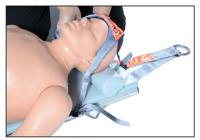
Figure 10 - Positioning the head using the harness

1. Using recognised patient handling techniques position the casualty on the Paraguard<sup>®</sup> Excel with their head level with the top of the stretcher.