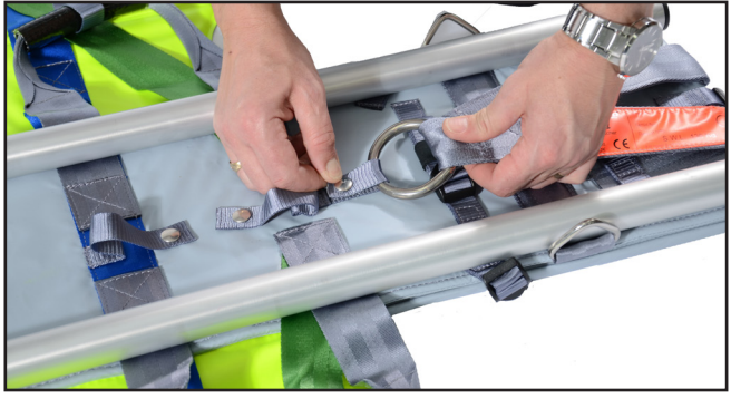
Figure 7 - Release vertical lifting rings

5. Un-clip the handle retaining straps and the GREEN strap buckle. If a vertical lift is planned, un-clip the GREY vertical lifting rings.