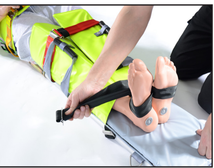
Figure 16 - Securing foot restraint 3