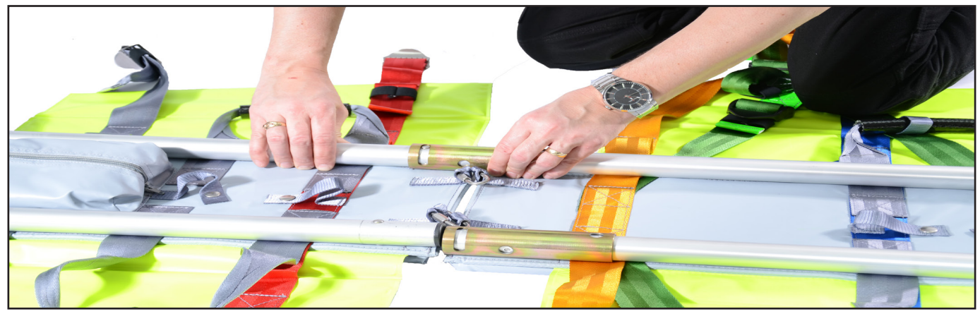
Figure 5 - Engage locking sleeve