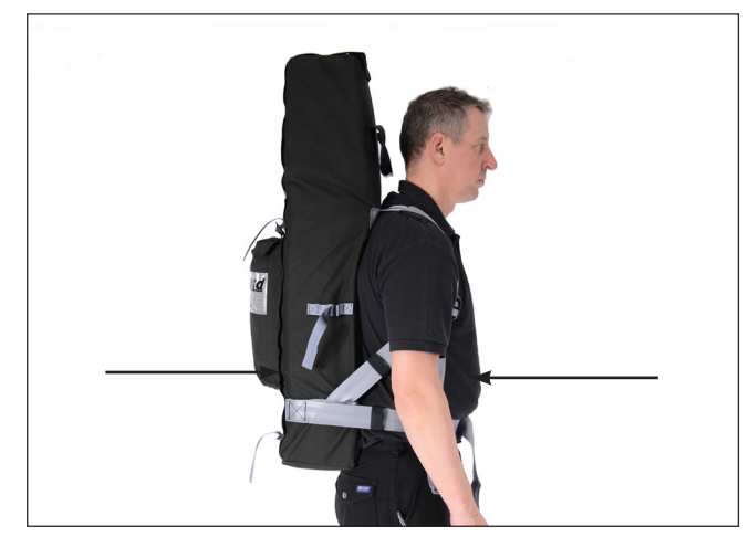
Figure 24 - Valise Backpack

Adjust the valise waist and shoulder straps to ensure comfortable backpacking. See Figure 24.