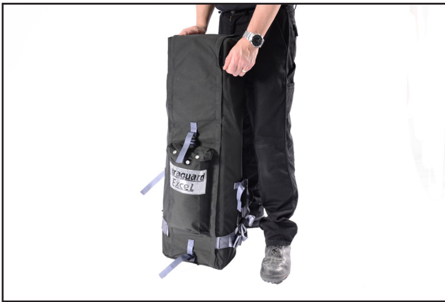
Figure 3 - Removing the Paraguard<sup>®</sup> from Valise