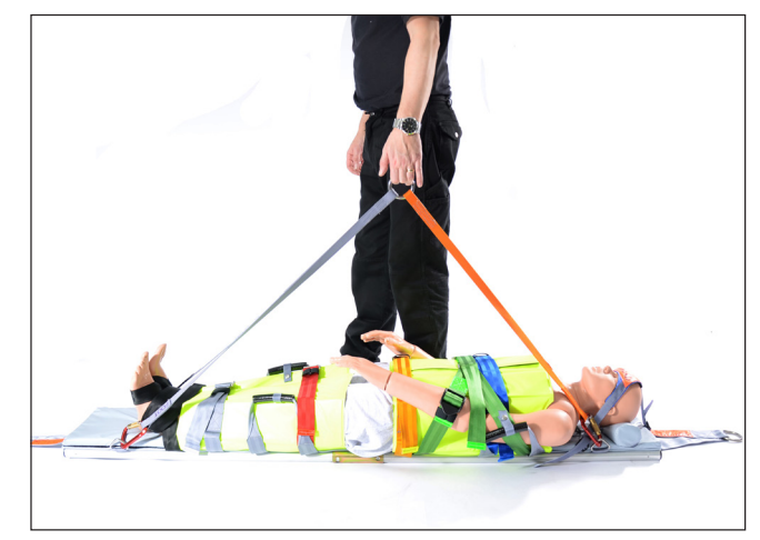
Figure 20 - Using Four Point Lifting Bridle

The longer straps are for use at the foot end. Lock all four Carabiners by rotating the knurled locking thimbles. Secure the side carrying handles to the GREEN strap and the leg-board using the GREY straps and press-studs.