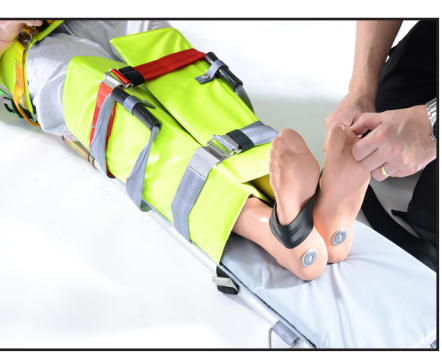
Figure 15 - Securing foot restraint 2