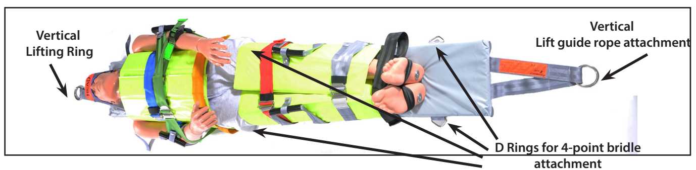
Attachment points for lifting

The casualty may be evacuated horizontally using the 4 fixing point D-rings on the sides of the unit or vertically using the vertical lift O rings at the head-end and foot-end.