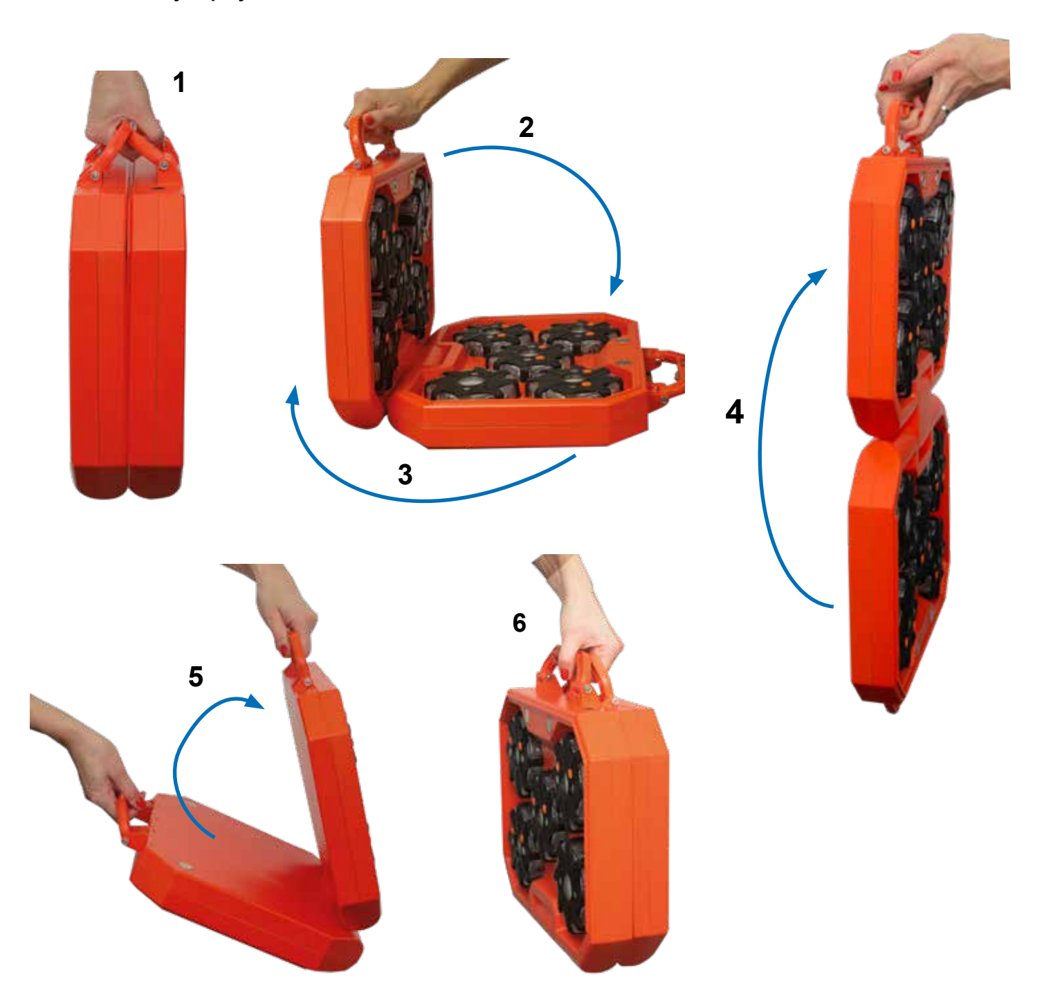
For fast and easy deployment the case can be folded back on itself.