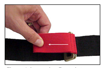
Figure 4, Loosening Restraint

To loosen a restraint, pull the breakaway tab toward the buckle (fig. 4). Continue pulling until the restraint is as loose as desired.