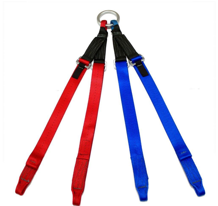
Model 15-0105 ..... Litter Bridle, Hard Eye Model